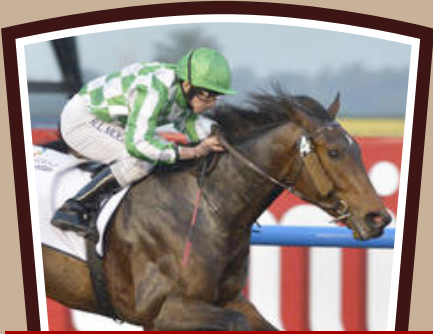
lines of battle