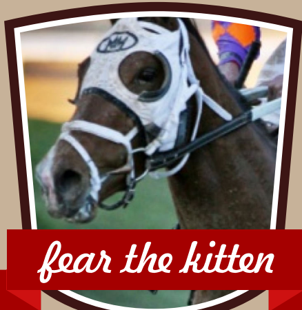
fear the kitten