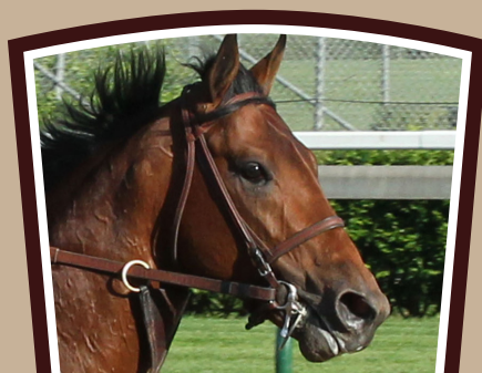
battle of midway