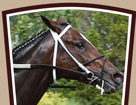
lookin at lee