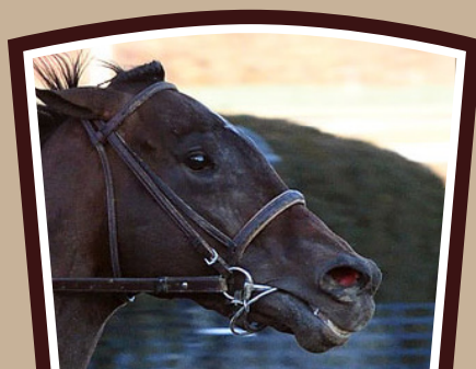
j boys echo