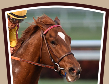
irish war cry